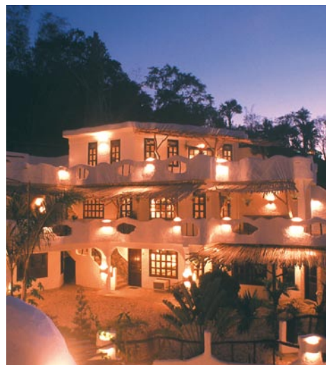
Atlantis Resort Puerto Galera

Experience some of Asia's best diving from two beautiful boutique resorts that aim to meet your every need. You will be met at the airport and transferred to the resort, where rooms feature air-conditioning, TV with free movie channels, minibars and en-suite facilities as standard, restaurants offer international and local cuisine and the dive set up is unrivalled. Both resorts offer swimming pools and an on-site PADI 5-star dive centre, from where five boat dives are offered each day, to small groups by knowledgeable guides. Nitrox and technical diving are also available. Non-divers and children are catered for with local excursions, to waterfalls or hidden paradises, jungle trips and hiking, local markets, kayaking or simply by relaxing on the beach. The two Atlantis Resorts can be combined as a twin centre or with other islands to suit your requirements.