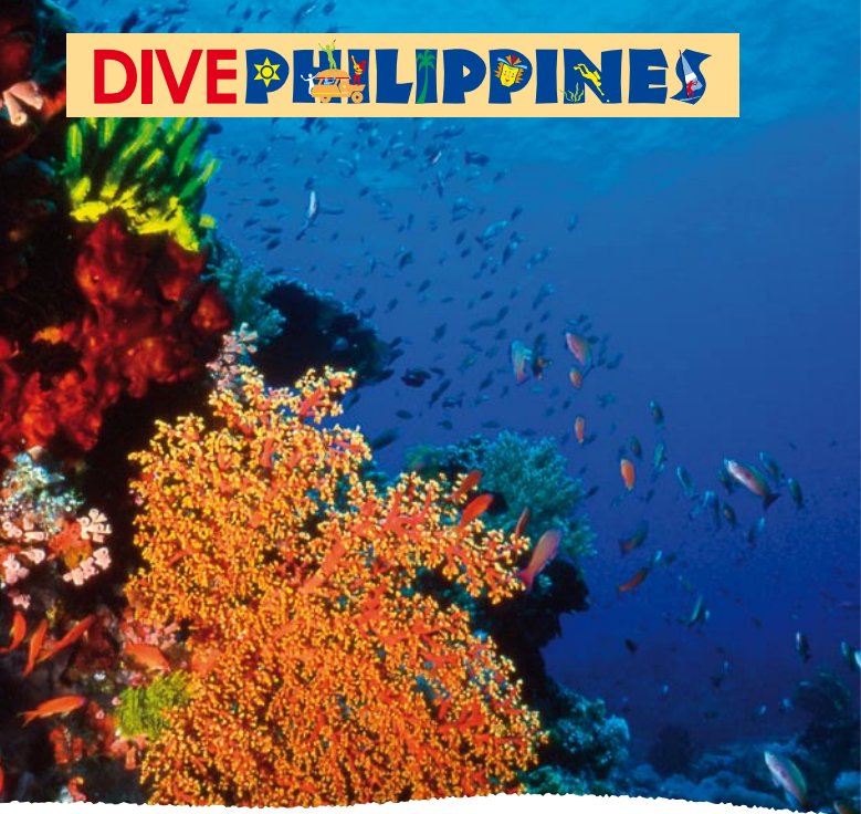
Coral reef scene