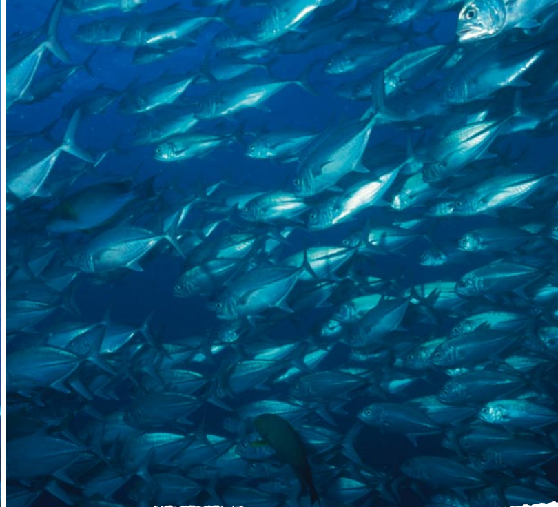
Dense school of bigeye jacks or trevally