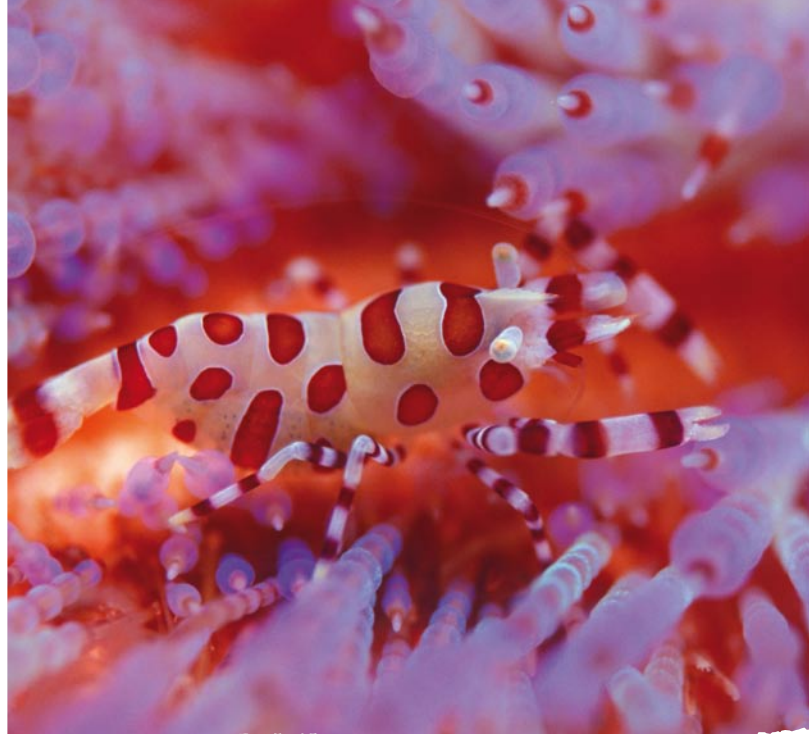
Coleman Shrimp