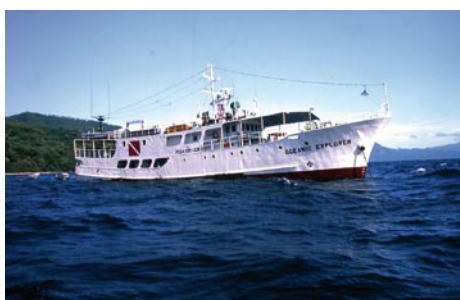
M.V. Oceanic Explorer

The M.V. Oceanic Explorer, M.V. Stella Maris Explorer and M.V. Apo Explorer visit the magnificent Tubbataha reefs between the months of March and June.